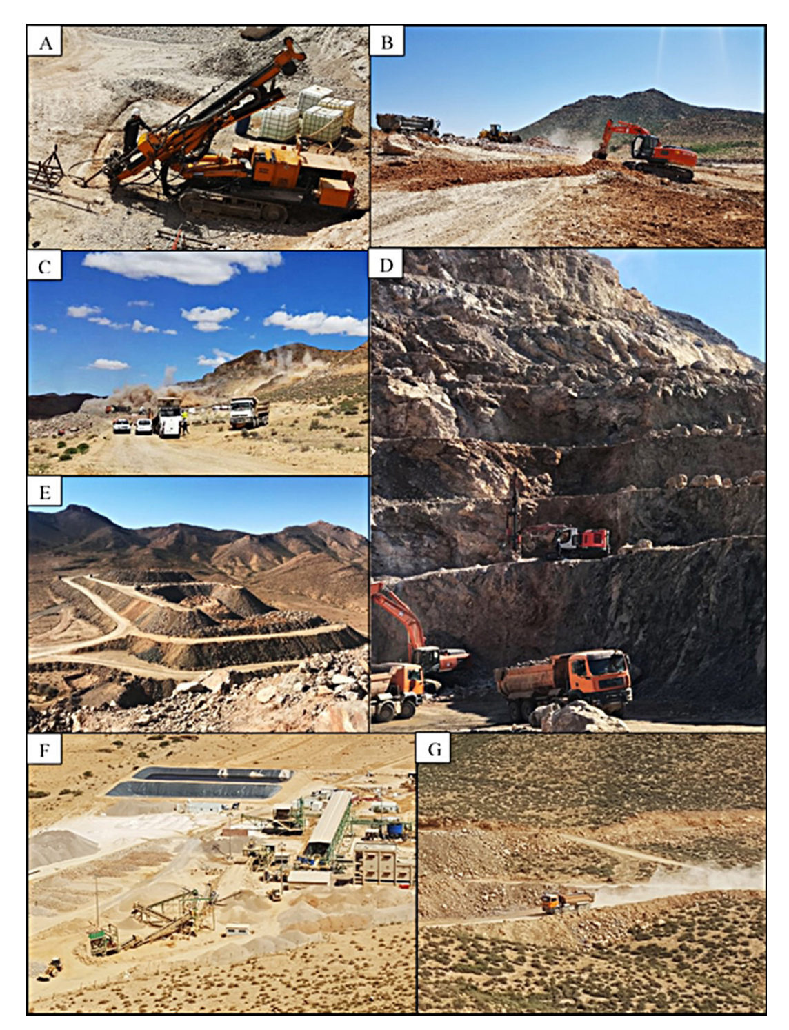
Figure 2. Illustration of some mining activities, Jbel Tirremi project, Morocco; A) exploration (drilling and boreholes); B) access tracks; C) blasting; D) open pit method (drilling and loading); E) dumping; F) panoramic view of GFL-GM Fluorspar plant; G) transportation

(3) the ICP (Inductively Coupled Plasma); and (4) the colorimetric. The parameters analyzed in the laboratory of Gujarat Fluorochemical limited (GFL) are divided into two categories: (i) Major elements (SO<sub>4</sub>, NO<sub>3</sub>, NO<sub>2</sub>, HCO<sub>3</sub>, Cl, Ca, Na, K, and Mg); and (ii) Minor elements (Al, Fe, Cd, Cu, Cr, Zn, Pb, As and Ni). A diagnosis of soil quality